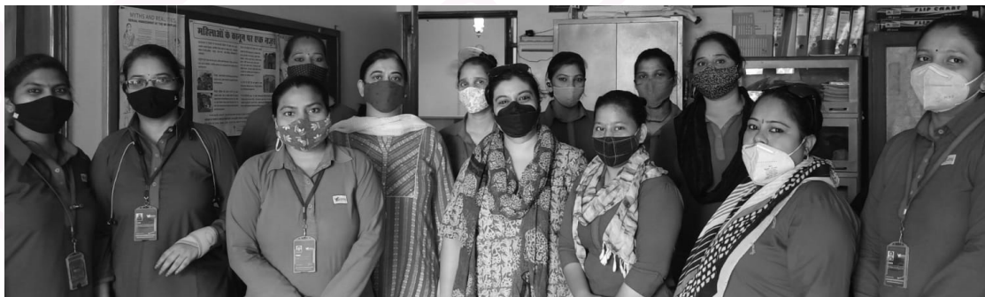
Women with Heavy Vehicle License before going for their skill test in October 2021